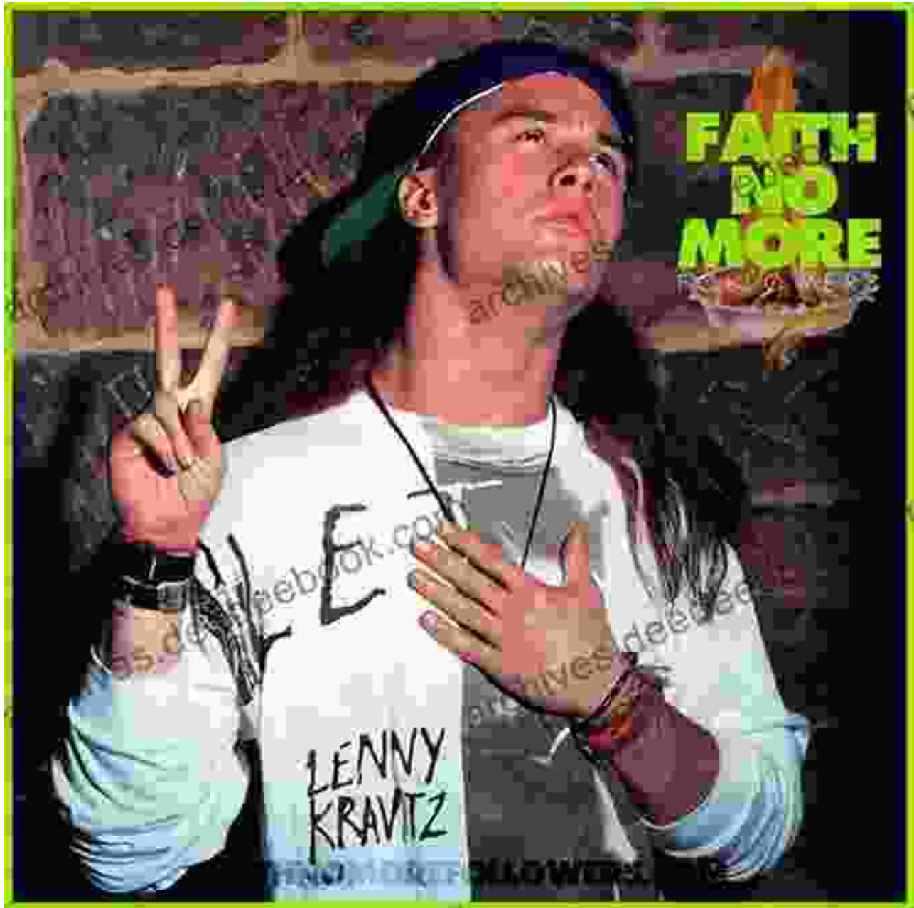
Mike Patton, iconic vocalist of Faith No More.

After Mosley's departure, Faith No More recruited Mike Patton, a young and versatile vocalist known for his experimental and theatrical