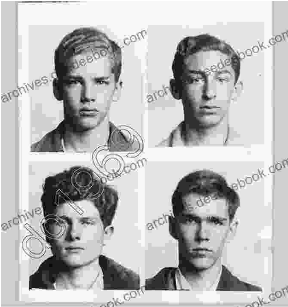
The Prime Time Burglars' mugshots.