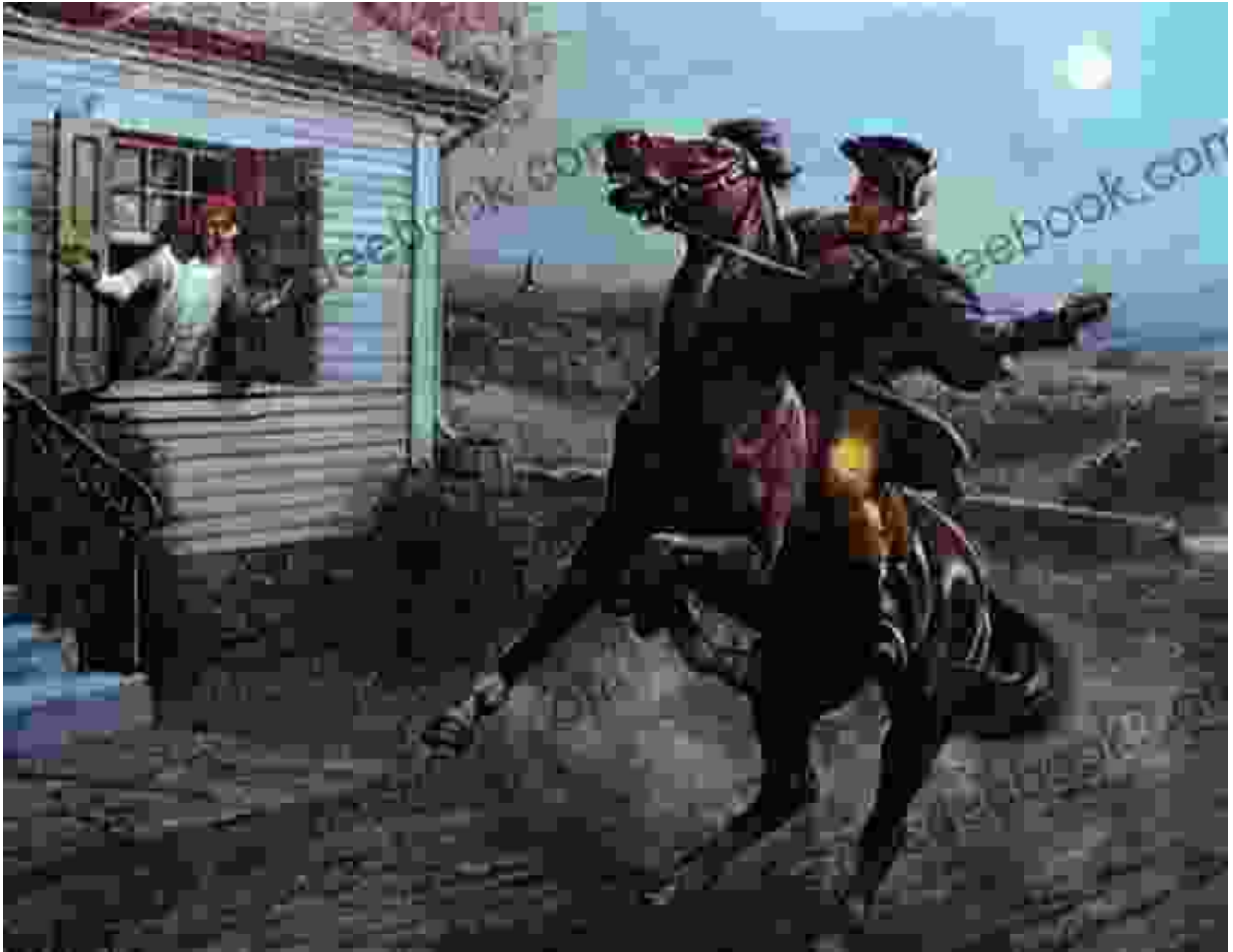
The Midnight Ride of Paul Revere

Revere's contributions to the war extended beyond his famous ride. He served as a courier, delivering messages between colonial leaders and troops in the field. He also designed and produced gunpowder and artillery for the Continental Army, demonstrating his versatility and unwavering commitment to the cause of liberty.