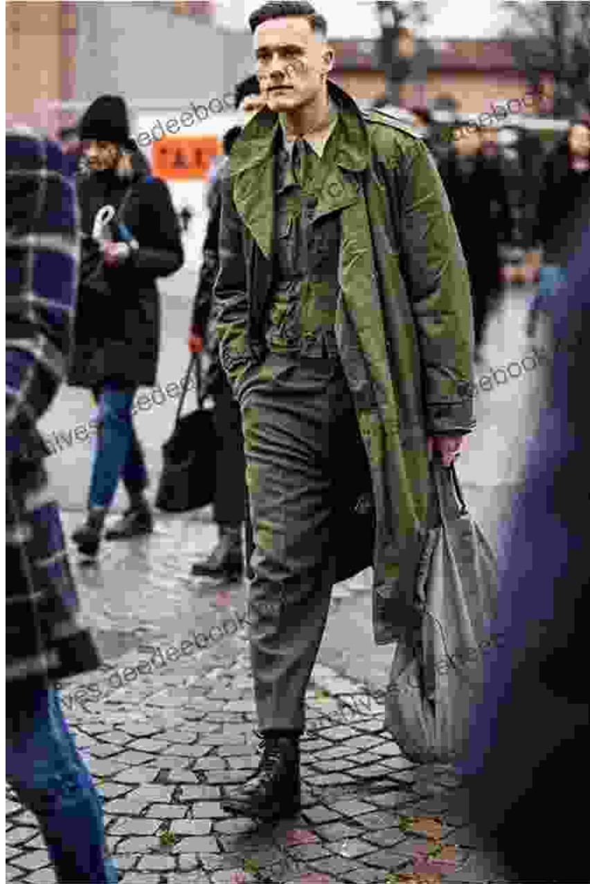
Fashion models wearing military-inspired clothing

In the years after the Vietnam War, military clothing began to lose its association with anti-war sentiment. Instead, military clothing became increasingly popular as a fashion trend. Designers began to incorporate military details into their clothing, and celebrities were often seen wearing