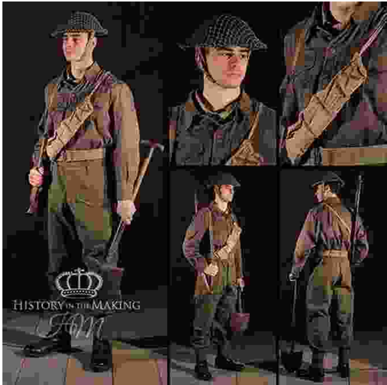
Soldiers in World War II wearing olive drab uniforms

World War II saw the continued evolution of military clothing. The new olive drab uniforms were even more functional than the khaki uniforms of World War I, and they featured a number of new details, such as snap closures and cargo pockets. These uniforms were also more comfortable and durable, and they were able to withstand the rigors of combat.